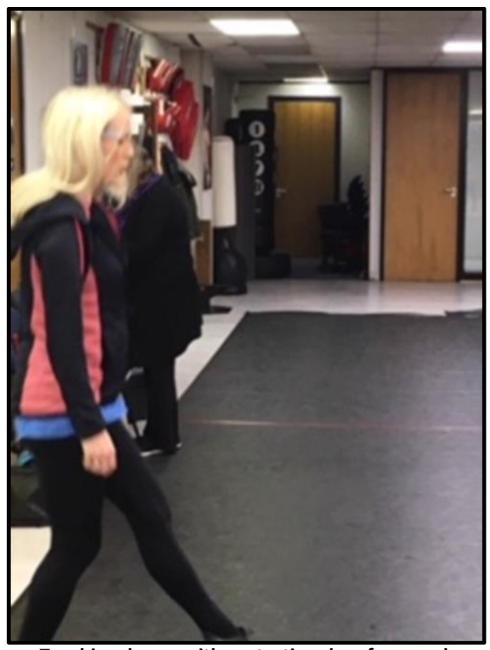
Teaching dance with protective clear face mask

Glasgow Sport has also helped us consult with our members and parents to find out how they are doing and also how we are doing as a dance school. We initially asked how the parents and members found our online classes which were mostly delivered via Zoom and the following is a summary of what we have received to date;