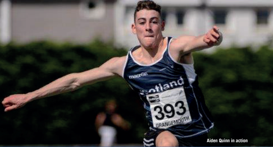
Aiden Quinn in action