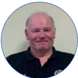
George Williamson Transport